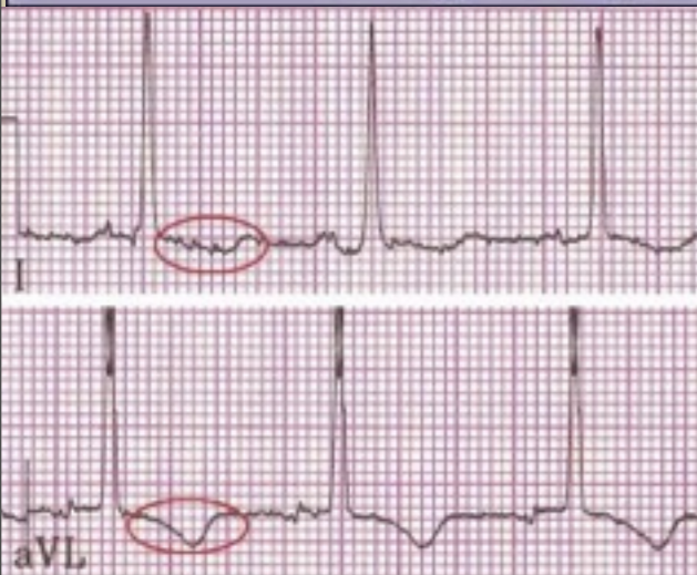
LV Strain Pattern